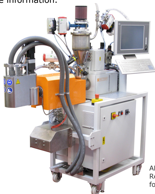
ALR-M with Receiving Unit for granules